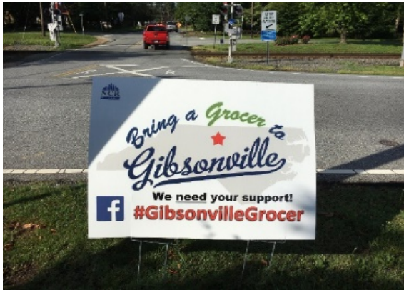
Figure 1: Sign Outside of Vacant Grocery Store in Gibsonville, Guilford County, North Carolina

Contemporary research on food insecurity has primarily focused on urban food deserts, such as those in Greensboro along the East Market Street corridor (Killian 2019) or the Durham-Chapel Hill region (Parsons 2012); however, rural food insecurity is indeed a problem, as shown in Figure 1 for Guilford County and across North Carolina as well. In particular, rural areas in North Carolina are unique because they can be hard to define (sometimes they are defined as to what they are not) and include regions and counties with diverse and distinctive racial and ethnic makeups. For example, rural counties in North Carolina include majority-minority counties such as Bertie County in the northeast that have a higher percentage of African American residents than White residents, largely homogeneous counties in the mountains, counties such as Duplin County where almost ¼ of all residents are Hispanic and counties such as Swain and Robeson Counties which have significant American Indian populations. Nonetheless, the general theme in much of the food desert literature