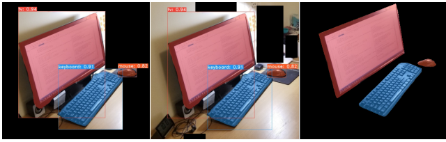
Figure 2: Concept visualization of three different privacy preservation methods: Whitelisting (Left), Blacklisting (Middle), Whitelisting with instance segmentation (Right). These conceptual figures were generated using YOLACT++ [2]

clear boundaries, but also vaguely-defined boundaries such as a wall, a parking lot, and scenery exist. Thus, it is difficult to maintain a list of all the blacklist objects of an input scene. Moreover, failing to obscure the background scene of an input may provide enough context to a malicious actor to infer a few missing data. The concept visualization of Whitelisting and Blacklisting approaches are shown in Figure 2.