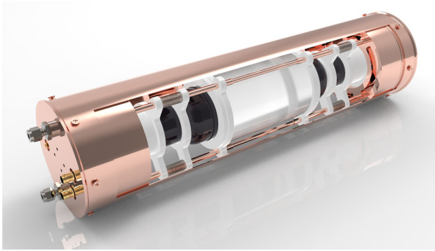
Fig. 1 Rendering of the detector module for the SABRE-PoP phase. The crystal is placed in a copper enclosure; the crystal wrapping is not shown. Two PMTs (black body) are coupled on each end of the crystal. PTFE holders (white) and copper rods keep the crystal and the PMTs in position

to assembly to remove any residual water. After the sealing, the detector module will be flushed with high purity N_2 gas to avoid humidity and radon. The cylindrical part of the enclosure has a diameter of 14.6 cm, a height of 58 cm and a thickness of 2 mm. It is closed by a shaft seal with Viton® O-rings. The enclosure sits vertically and the top end-cap is furnished with bulkhead feedthroughs for the PMT high voltage and signal cables and for teflon tubes. The latter will allow flushing of the inner volume with dry nitrogen gas. The copper enclosure will be placed inside a 1.3 m (diameter) \times 1.5 m (length) cylindrical vessel filled with about two tons of pseudocumene and instrumented with ten 8-inch PMTs. The vessel is made from low-radioactivity stainless steel with access via a 60 cm diameter flange at the top. The vessel's inner surface is coated with Ethylene tetrafluoroethylene (ETFE) to prevent scintillator degradation due to direct contact with the stainless steel. A Lumirror™ liner with 95% reflectance above 400 nm is applied inside to improve light reflection. Each flat end of the vessel hosts five Hamamatsu R5912-100 PMTs with 35% quantum efficiency at 390 nm. The liquid scintillator is (1, 2, 4) Trimethylbenzene (pseudocumene, PC) from the Borexino facility [28], doped with 3 g/l of (2,5)-diphenyloxazole (PPO), which acts as wavelength shifter. The expected light yield is 0.22 photoelectrons/keV ee [29].