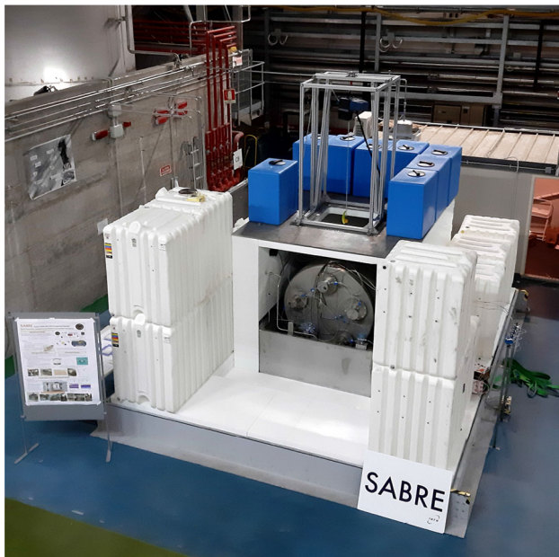
Fig. 3 The SABRE-PoP setup under construction in LNGS Hall-C

the top and bottom and at least 40 cm on the four sides. The polyethylene supports a 2 cm steel plate at the top, where the insertion system can be mounted overhanging. Water tanks are placed on top of the plate and on the sides of the shielding for a water thickness of 80 cm and 91 cm, respectively. The shielding castle is completed with a 15 cm lead floor. The technical design of the insertion system and of the passive shielding surrounding the vessel is shown in Fig. 2. The polyethylene shell will be sealed, allowing the inner volume to be flushed with dry and clean N_2 -gas, to avoid radon gas which is present in the laboratory air.