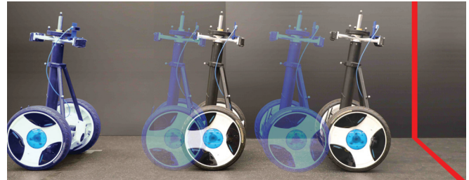
Fig. 1. Visualization of desired Segway behavior. The Segway is driven from left to right and must not cross the red line. The transparent blue images represent the measured position whereas the opaque images represent the true position. Traditional CBFs do not account for this uncertainty.