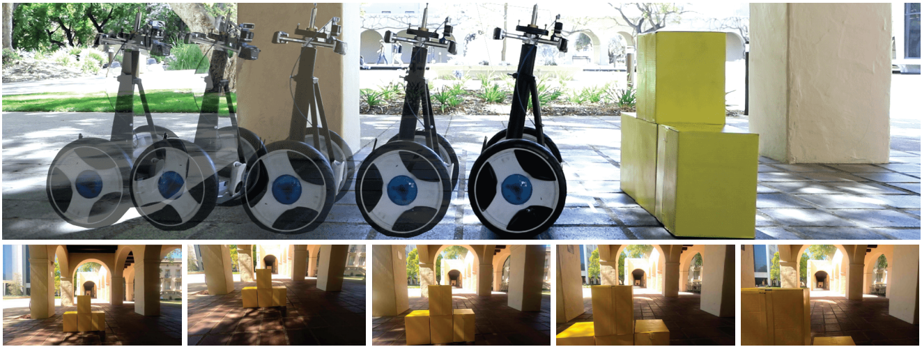
Fig. 4. Images from the experiment using the MR-BS-OP controller. The Segway is piloted towards a wall of yellow boxes and the controller ensures that it remains safe, i.e. that it does not crash into the boxes. (Top) Time lapse of the Segway trajectory. (Bottom) Camera images taken from the perspective of the Segway throughout the experiment. The images are displayed in chronological order from left to right. A video can be found at [25].