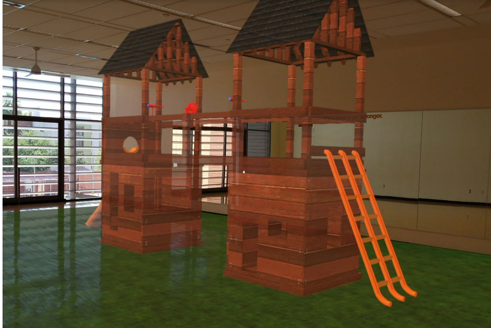
Figure 1 – Playground structure

Data were collected from 38 participants at two large, public universities in the western United States. Participants were asked to take a pre-survey to gauge their initial thoughts about their priorities in the design and note their prior experiences with mixed reality technology. Afterward, each participant was fitted with a Microsoft HoloLens for the experiment. Participants were then asked to redesign the playground structure to better satisfy the needs of the local community. At their disposal was a catalog of materials and resources that could be used for the redesign.