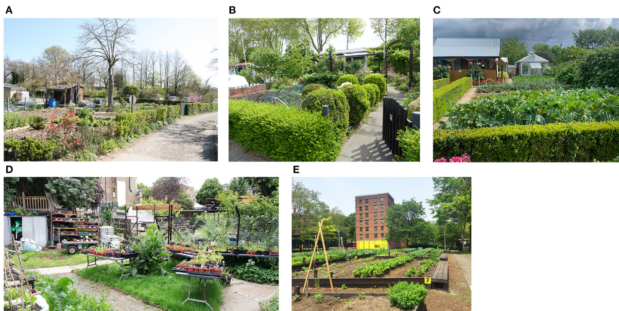
FIGURE 2 | Photographs to show examples of gardens included in the study. (A) Allotment garden, France. (B) Allotment garden, Germany. (C) Allotment garden, Poland. (D) Community garden, UK. (E) Urban farm, USA.

and policies to reduce its spread were initially implemented. The questionnaire investigated the impact of COVID-19 on the farms and gardens in terms of: (1) accessibility and service provision; (2) changes in operational arrangements; (3) impacts on production; and (4) future outlook. Moreover, the survey had an open-ended question that invited insights on related issues that gardeners believed to be relevant and important.