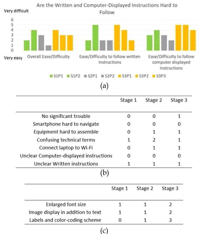
FIGURE 4. Participants' responses to Questions 1-3, from which we evaluate the clarity of the written and computer-displayed instructions. For all questions in the three subplots, we asked the participants to answer them after they finished up following the manual to deploy the system out-of-the-box.