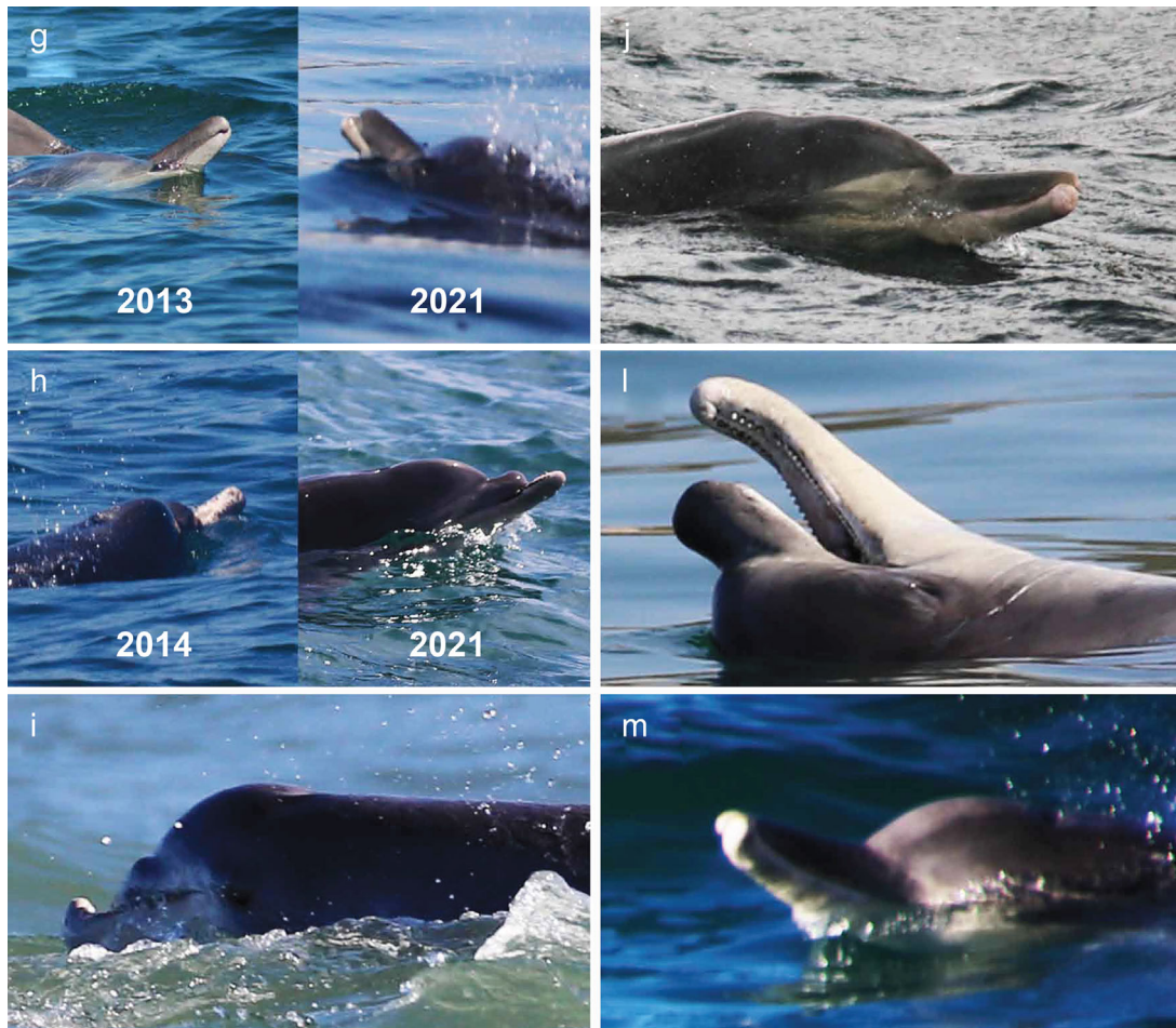
Figure 2 Continued

the presence of an associated calf. The sex of all the other individuals remains undetermined.