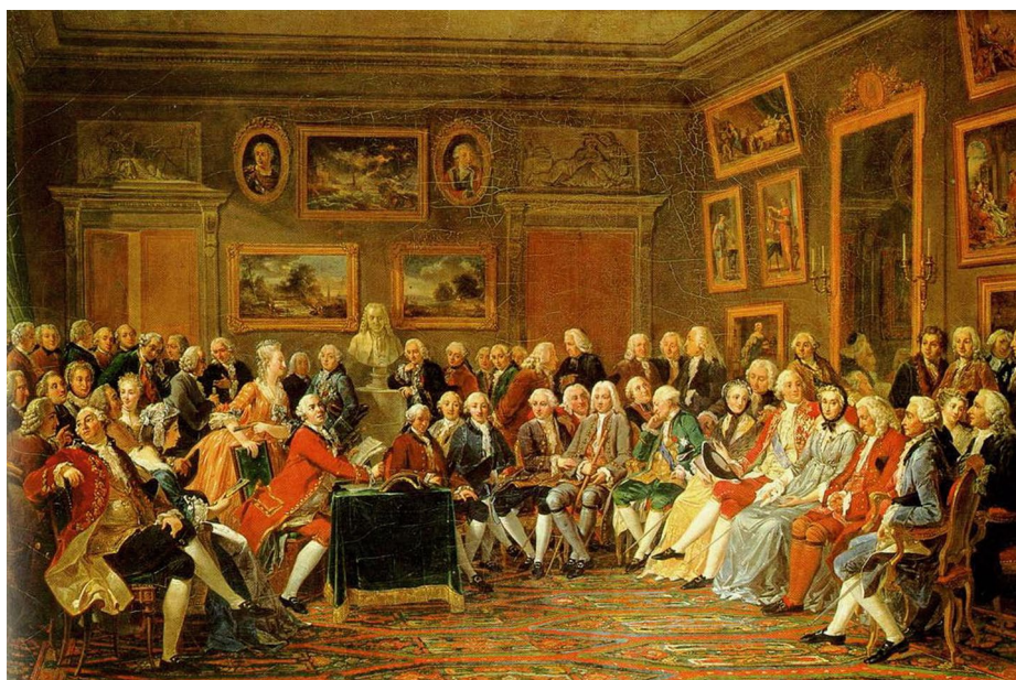
Fig. 1 | Enlightenment salon. Reading of Voltaire's tragedy of the Orphan of China in the salon of Marie Thérèse Rodet Geoffrin, by Anicet Charles Gabriel Lemonnier (1812).

However, it is not just a question of adding positive and negative evidence on a ledger to determine whether a claim is valid. The meta-research literature clearly demonstrates that social and institutional factors have crucial roles in deciding which claims are tested, and having been tested, which results of those tests are published 6,7 . Indeed, the growth of both the scientific literature and the complexity of research methods has been accompanied by an increase in concerns about the reproducibility of published methods, results, and inferences 8 . Thus, Belikov et al. 1 test the literature claims against Library