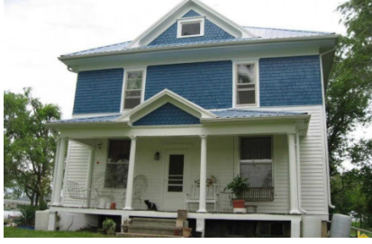
(a) This 4 BD/2 BA in Mora MUST be seen. Call, text or direct message me for more info!