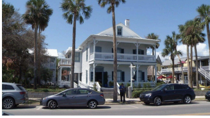
(b) St. Augustine bed & breakfast picking up the pieces after Hurricane Irma