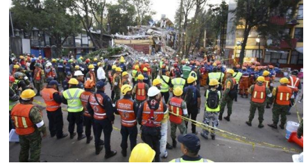
(e) Magnitude 6.1 aftershock hits Mexico as search for people and pets continues