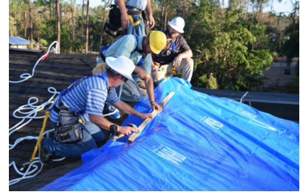
(d) Irma update: Free roof help available