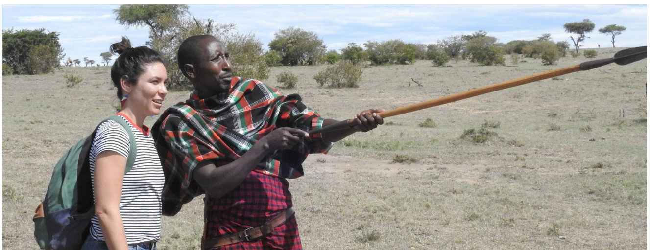
Local community guides earned income by taking tourists on walks through the Mara Naboisho Conservancy — income that has now ceased as a result of the pandemic

Wildlife and nature tourism are major contributors to economic activity around the world. Before the pandemic, researchers estimated that the world's protected areas received roughly eight billion visits per year, generating approximately USD 600 billion per year in direct in-country expenditure and USD 250 billion per year in consumer surplus (Balmford et al., 2015). A 2019 estimate puts the direct value of wildlife tourism at USD 120 billion or USD 346 billion when multiplier effects are accounted for, and it generated 21.8 million jobs (World Travel and Tourism Council, 2019). This income has virtually stopped as a result of COVID-19: a recent survey of African safari tour operators found that over 90 per cent of them had experienced declines of greater than 75 per cent in bookings and many indicated they had no bookings at all, thus affecting local employment 3 . With more than 16 million people directly or indirectly employed in tourism within the African region, the impact is immense. Community-based conservation areas in particular provide income support for families through a share in tourism-derived income. The Mara Naboisho Conservancy in Kenya, for example, provided the main cash income for over 600 Maasai families; this has now disappeared with the cessation of tourism 4 .