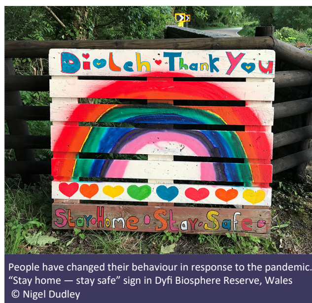
People have changed their behaviour in response to the pandemic. "Stay home — stay safe" sign in Dyfi Biosphere Reserve, Wales

There may well be differences among types of illegal exploitation. For example, high value transnational trafficking may be temporarily declining because of the lockdown and travel restrictions 26 , whilst poaching for bushmeat, encroachment for grazing 27 or illegal fishing in marine protected areas may be increasing. In the Seychelles 28 , Fiji 29 , Indonesia, the Philippines and Hawai'i 30 , there are reports of increasing fishing pressure in marine protected and conserved areas, which is encouraged by a reduced management presence. Lockdowns and travel restrictions along with reduced employment and livelihood opportunities mean local communities are increasingly depending on subsistence harvesting and foraging, which could potentially lead to overharvesting. This can be exacerbated when people return to their home communities from urban areas.