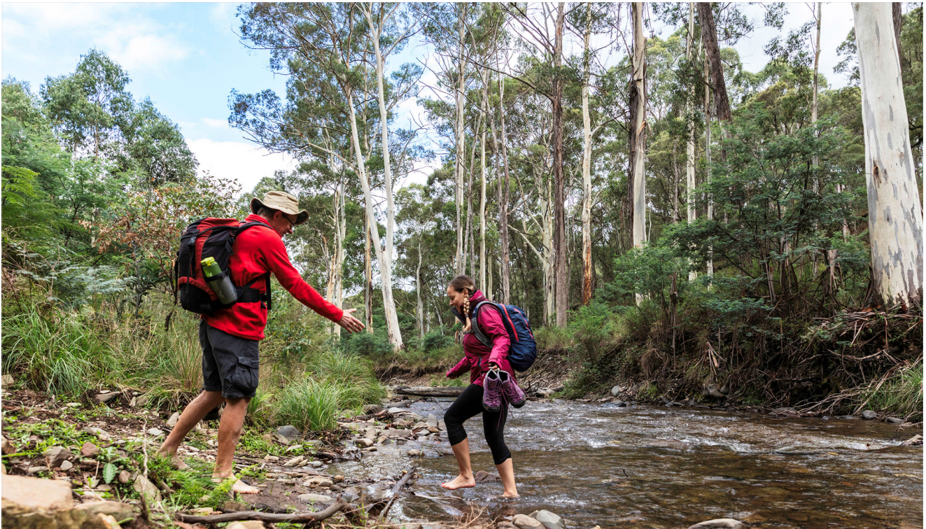
Parks are a natural solution that can help secure human health and well-being; bushwalking in the Ovens River region, Alpine National Park, Victoria

and are a natural solution for securing human health and well-being. Nature can have therapeutic effects for people suffering the effects of social isolation. The mental health benefits derived from time spent in nature will also translate into economic benefits, such as avoided health care costs (Buckley et al., 2019; MacKinnon et al., 2019). In particular, urban parks and protected areas are becoming a lifeline for physical and mental health (Mell, 2020; Surico, 2020); this increased usage and interest could have additional benefits for protected and conserved areas and green space more generally.