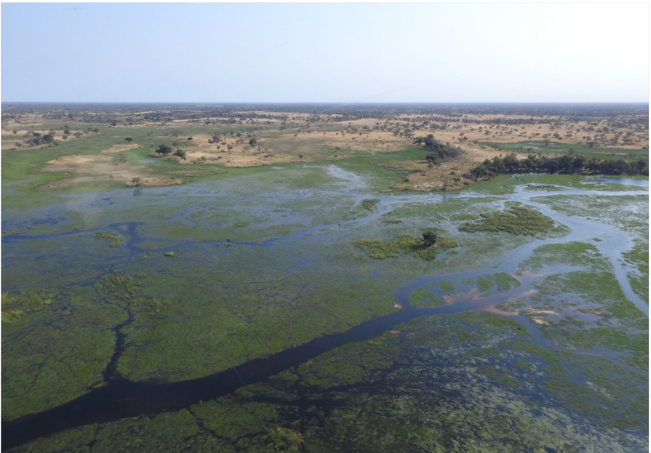
Large, well-connected, and well-managed protected and conserved areas will be an important element of rebuilding; Okavango Delta, Botswana

Many protected and conserved areas are critically short of management capacity, and managers now face new challenges.