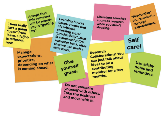
Figure 2. A subset of suggestions we received when we asked, “It’s your first semester back from leave: what are strategies to stay productive this semester?”

During the workshop, we sought to collectively brainstorm ideas that individuals could use “out of the box” as mathematicians navigating parenthood. Here we summarize tips from our panel discussion and breakout sessions.