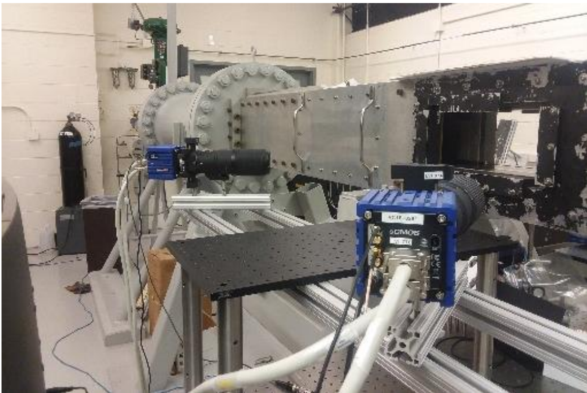
Figure 1: Rutgers wind tunnel laboratory.

In 2020, the identical lab setups for all five labs that were conducted in-person lab in 2019 were used. However, instead of students performing the lab tasks with the guidance of the TA; they observed the TA conduct the lab synchronously via multiple video feeds while logged on to a video conference platform. A schematic of the virtual lab set up is provided in Figure 2. In these remote virtual labs, several cameras were used to focus on specific aspects of the equipment where inputs were provided, and data captured. Students observed the operation of the equipment synchronously as the TA directed the lab procedures. In cases where it was possible, TA's asked students to indicate the steps in the procedure and/or express parameters for operation.