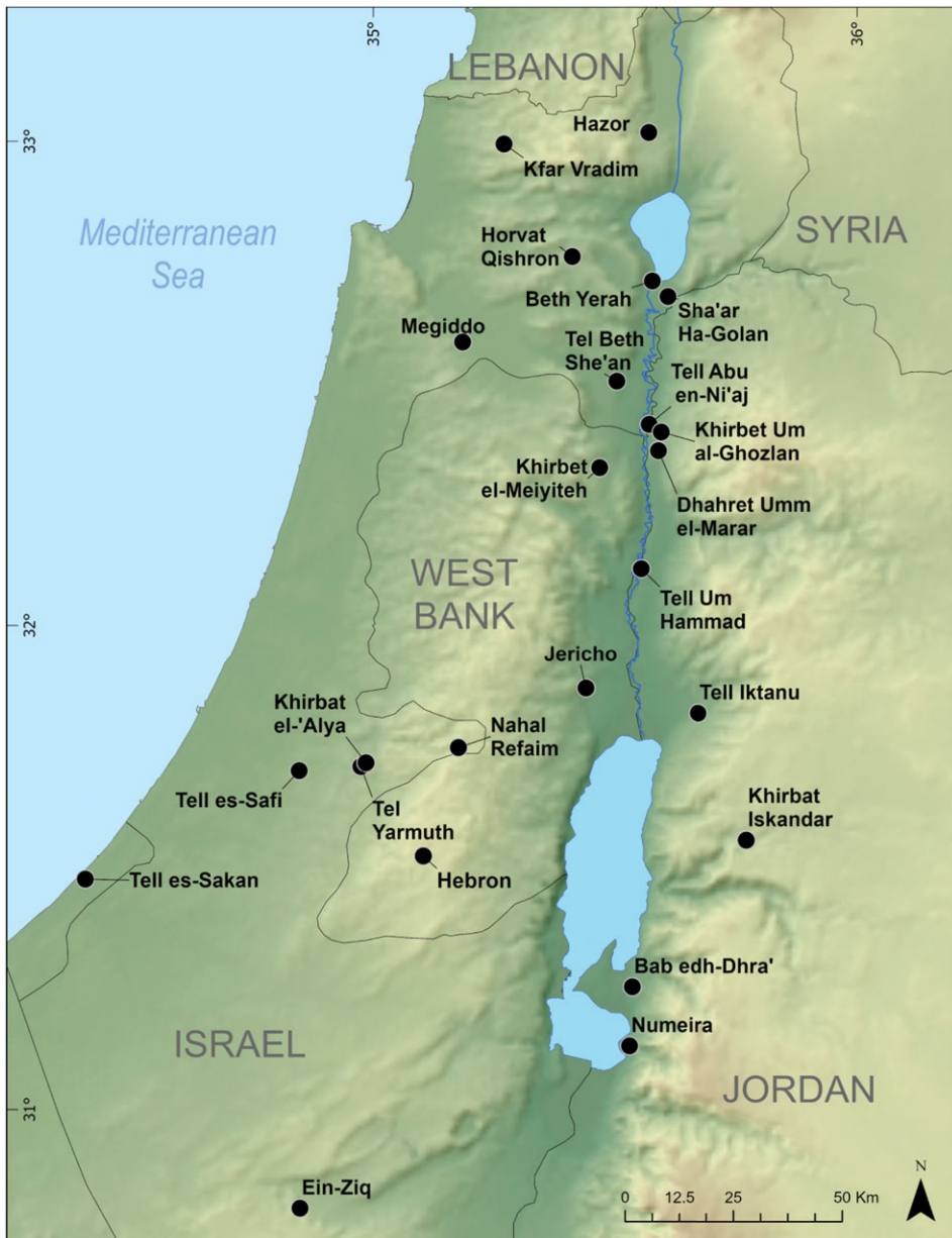
Figure 1 Map of the Southern Levant showing EB III and EB IV archaeological sites discussed in text.

2200 and 2000 BCE (see discussion in Sharon 2014). A reevaluation of EB IV society has stemmed from several related lines of investigation during the past three decades. The importance of EB IV sedentary agrarian communities has been illuminated through the reevaluation of regional survey data (e.g., Palumbo 1991, 2008) and excavations at a growing number of sedentary settlements (Figure 1). These excavations document EB IV villages at Tell Abu en-Ni'aj (Falconer and Fall 2019), Tell Um Hammad (Helms 1986;