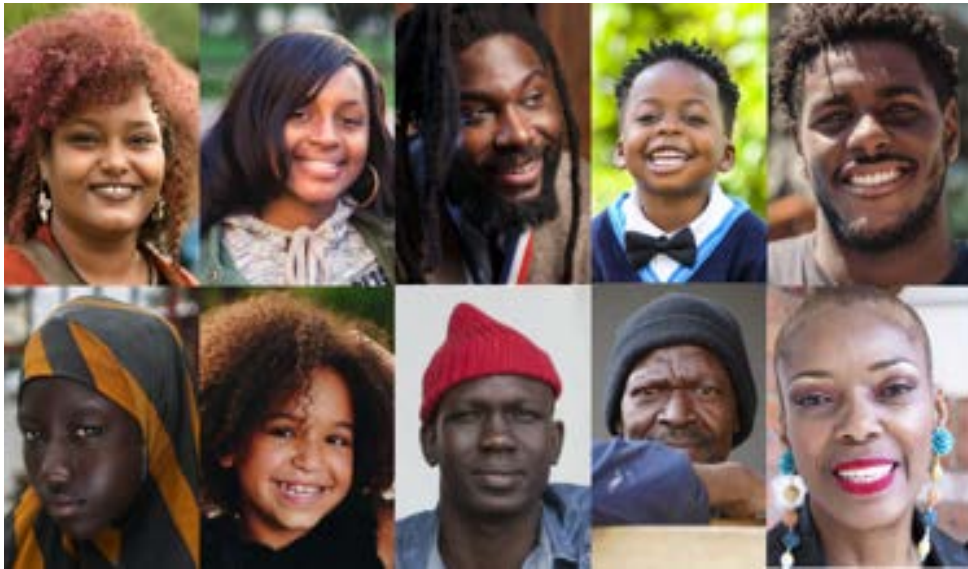
Figure 1 Sample of Image Collection

*Note: Citations for these images can be found in the Unit Plan in the Appendix, Lesson 1 “Example Slide”