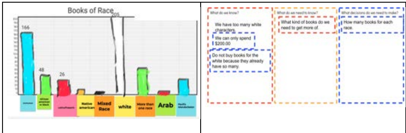
Figure 5 Third-Grade Group Graph and Analysis

In the fourth- and fifth-grade analysis, students noted that the proportion of books with white main characters is roughly the same as the proportion of Black students in the school (see Figure 6). The left pie chart shows the racial makeup of the school with 62% African American, 25% White, and smaller percentages of other races. In contrast, the right pie chart shows how students categorized books: 68% White, 21% More than One Race, 6% African American, and smaller percentages of other races.