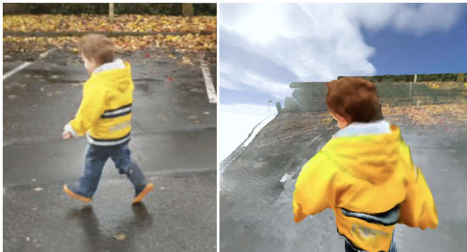
Fig. 3. Comparison of output between NSFF [4] and our pipeline on the ‘kid running’ sequence. Please note that we are not using image inpainting to fill in missing parts of the scene.

achieve the same visual quality and have more visual artefacts present, there is still a major advantage in that the results are created within a few minutes and rendered at interactive frame rates on a VR headset.