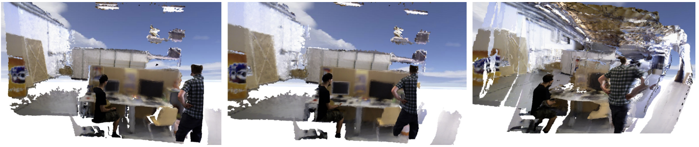
Fig. 1. VRVideos: Left) VR video created from ground truth (Actual depth data and pose data), Middle) VR video from actual depth data and computed pose data, Right) VR video from monocular video using estimated depth and estimated pose data.

exhibits realistic motion parallax. However, their method is only demonstrated on static scenes without any people. Niklaus et al. [9] and Kopf et al. [2] leverage learned depth estimation models and inpainting to produce realistic view synthesis. Niklaus et al. [9] focus on creating a 3D zoom effect and introduce a pipeline for improving off-the-shelf depth estimation models, addressing common issues with depth estimation models such as wavy walls.