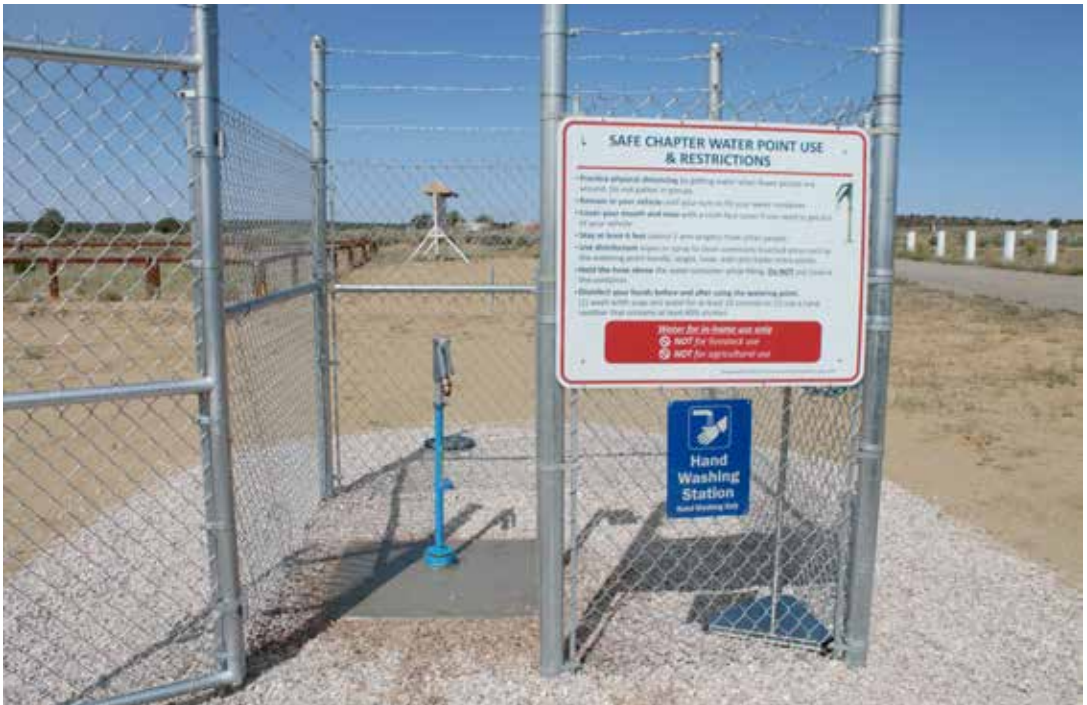
A newly installed transitional water point on the Navajo Nation, one of 59 constructed during the COVID-19 pandemic.

water and to eliminate the reliance on unregulated, potentially contaminated sources.