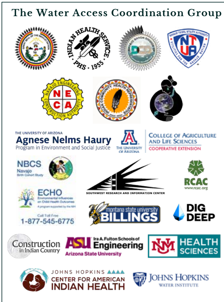
FIGURE 2 Navajo Nation COVID-19 Water Access Coordination Group

Source: Water Access Coordination Group (2022)