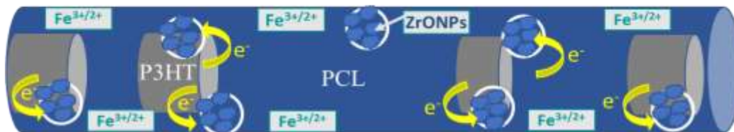
Figure 1. Schematic showing the design of photocatalytic denitrification polymer fibers used in the filter for nitrate reduction. Photons absorbed by P3HT would facilitate electron injection from the P3HT to ZrONPs at the polymer surface. \text{Fe}^{3+/2+} in the structure acts as an electron mediator while the reduction reaction occurs at the surface of ZrONPs. Gold or silver nanoparticles doped into the polymer shell will be used to scatter light and improve catalysis efficiencies (not shown).