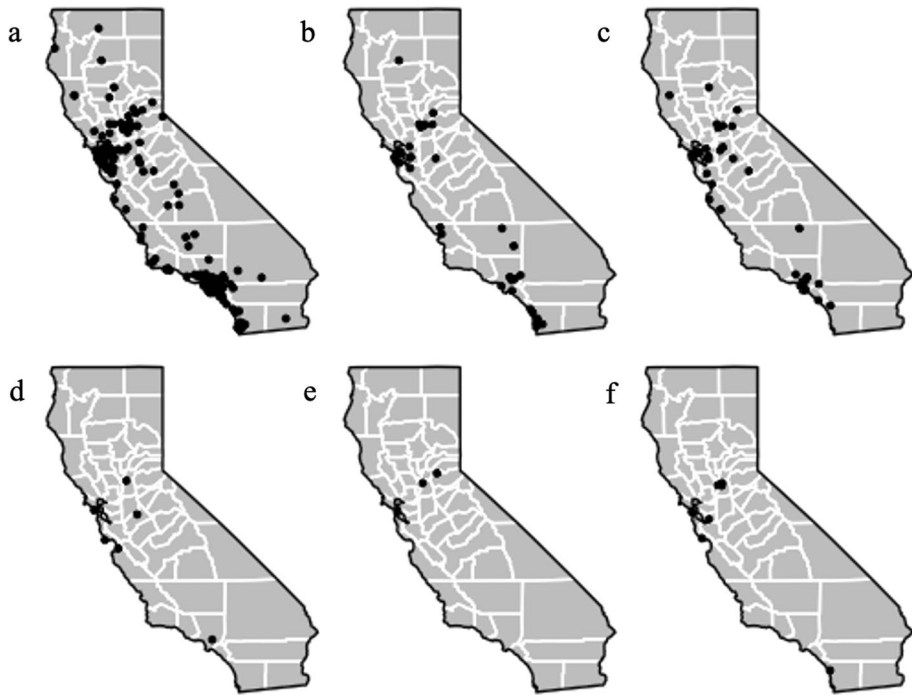
Fig. 1 Extreme weather impacts reported by survey respondents by type (unweighted) and zip code: a drought ( n=188 ); b wildfire ( n=40 ); c heatwaves ( n=39 ); d flood ( n=6 ); e landslide ( n=3 ); f other impacts ( n=7 )

understand reported concern about climate impacts to water supply. 5 Descriptive statistics for the mean score as well as the four scaled proxy indicators are provided in the Supplemental Information.