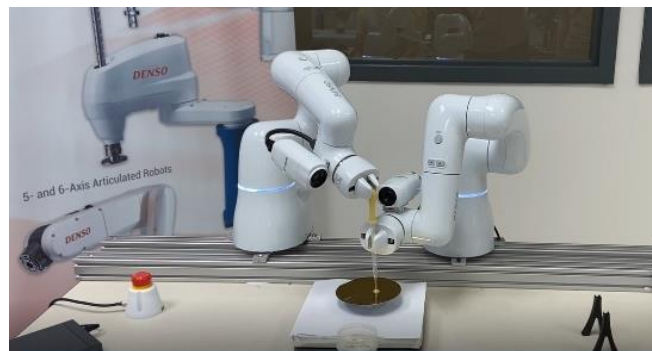
Fig. 1. Next-generation intelligent robots are highly portable, can work collaboratively with human operators and have the ability to self-learn.

On the technological level, the pandemic exposed the urgent need for more preparedness in developing self-sufficiency in the supply chain [1]. The supply chain disruptions seen during the pandemic have abruptly accelerated the use of next-generation intelligent robotics [14] [15] and additive manufacturing [16] (fig. 1.) as well as a shift from the two-decade-long trend of having complex benchtop Point-of-Need instruments towards simplicity and portability. This shift is expected to last into the next decade, as shown in Fig. 2 below [17].