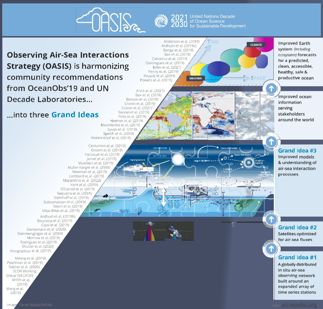
Figure 1. Three interlinked “Grand Ideas” of the OASIS and their relation to an end-to-end ocean information delivery for improved Earth system forecasts, including for ecosystems. Community strategy paper citations calling for the OASIS recommendations are shown here and in the reference list. Mapped fields in the second from the top layer, include (left) surface p\text{CO}_2 from the Surface Ocean \text{CO}_2 Atlas (Bakker et al. , 2016), (middle) daily average net downward heat flux on 3 September 2010 from prototype ORAS6 reanalysis, and (right) total cloud cover from ECMWF Reanalysis-5 (ERA5) reanalysis (Hersbach et al. , 2020) at 3 September 2010 T-12:00.

while providing opportunities for engagement by Early Career Ocean Professionals (ECOPs) and scientists from under-resourced nations and institutions. In addition, the co-location of multiple EOVS, including Essential Biodiversity Variables (EBVs), will revolutionize our ability to interrogate impacts from multiple stressors on ecosystems, from changes in biogeochemistry to components of the food web, and build robust state-of-the-art ecological forecasts.