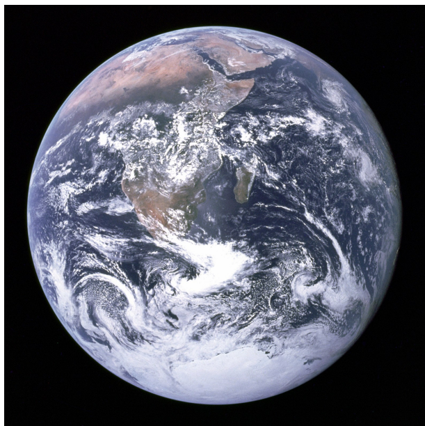
Figure 4. The "Blue Marble" photograph of the Earth was taken by the crew of Apollo 17 en route to the Moon on 7 December 1972. Image courtesy: NASA (see: https://www.nasa.gov/topics/earth/features/astronauts_eyes.html ).

cate balances that govern weather, climate, water, the carbon cycle, and the ocean environment, and a better understanding of how to maintain these balances for the benefit of all.