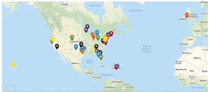
Figure 1. Over the past seven years, PC student participants have come from more than 36 different universities.

Not surprisingly, the format of the PC program is evolving with the times. In 2020, a virtual version of the traditional four-day format was adopted, with everyone, organizers and students, remotely located (Figure 2). Community building is a hallmark of PC, and, despite the virtual setting, a combination of presymposium team interactions, amazing involvement from panelists and speakers, and several small group-based activities during IMS2020 resulted in a remarkably successful event. For 2021, Project Connect will continue the virtual agenda.