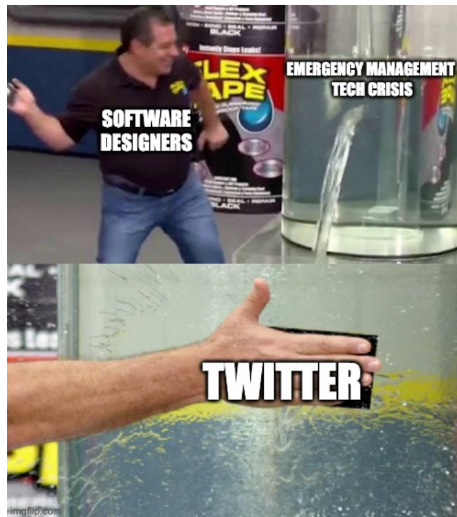
Figure 1. For many years, we have seen papers that attempt to solve age-old issues like situation awareness with sophisticated tools replete with features and dependencies that could never survive in the wild. This is what we need to stop doing.

bring the mental model of plain-old telephone services from their childhood to the mobile ICT world. Help, in these cases, falls under the responsibilities of emergency management (EM) practitioners: local, state, national, federal, or tribal responders, depending on the type of hazard and its breadth. These groups will most likely not know consumers are asking for help from said devices.