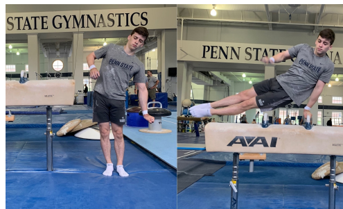
Fig. 1: A gymnast visualizes a pommel horse move on the left and physically performs the move on the right.

the pommel horse in real life, helping the user train focus and muscle memory without undergoing intense, potentially dangerous physical activity.