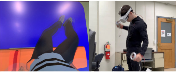
Fig. 3: First-person virtual pommel horse move pictured on the left and associated user action pictured on the right.

Fig. 3 shows a user performing gymnastics within the virtual environment. Lowering the user's hand within a certain range of a virtual pommel and squeezing the corresponding Oculus Touch controller causes the virtual gymnast to perform an appropriate fraction of the desired gymnastics move. The user repeats this action with the other hand to complete the next part of the move. Doing this in an alternating fashion allows the gymnast to smoothly perform the moves desired by the user. A demo video is available at [3].