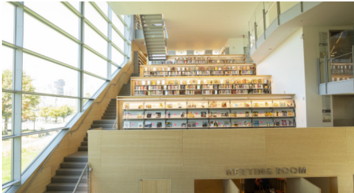
Figure 1: The main staircase of Hunters Point library, and some of the levels only reachable by it