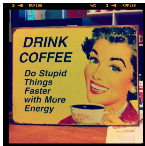
FIG 4. No changes made.