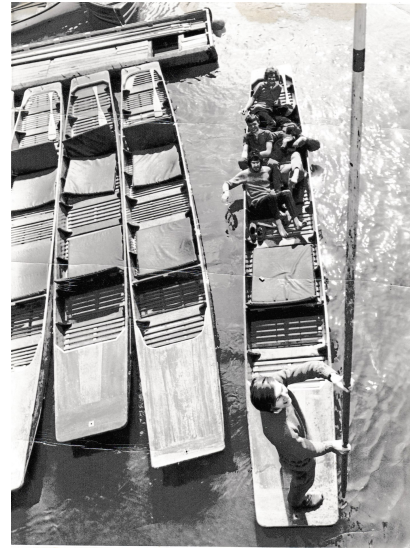
FIG 2. 1972: Aldous punting on the River Cam

But I feel that we were genuinely much less stressed than subsequent generations of students, if only from the unconscious belief that by getting into Cambridge we had already "won", and that few of us worried about future careers. There was time and energy to be social (Figure 2), and I still keep in touch with a group of (mostly non-mathematical) friends who have subsequently led interesting lives.