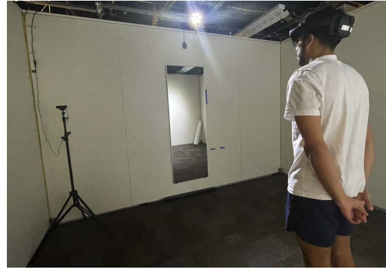
Figure 1: Experimental setup: Person standing on a marked location in the experimental room in front of the mirror wearing a HoloLens 2.