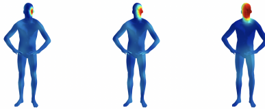
Figure 2: Wavelets on the FAUST dataset with g(\lambda) = e^{-0.0005\lambda} , j = 1, 3, 5 from left to right. Positive values are red.