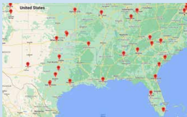
Pollen stations accredited by the National Allergy Bureau (NAB) in the US

(posted with permission from the American Academy of Allergy, Asthma & Immunology (AAAAI) – visit AAAAI.org for additional information and updates)