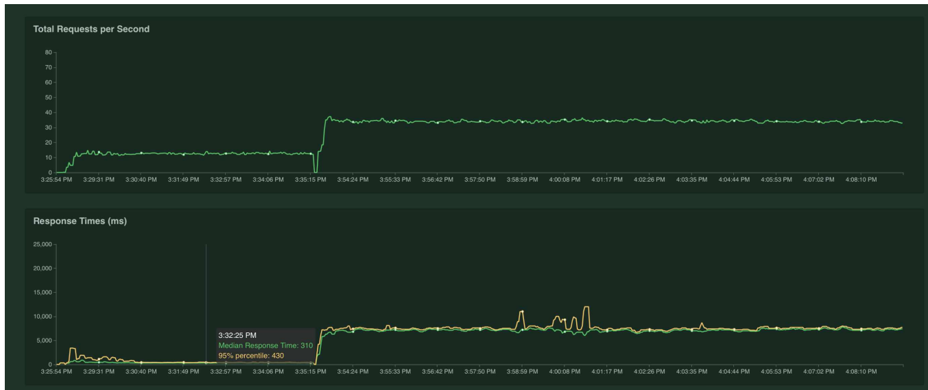
Figure 1: Load test with Locust. 32,520 requests over 5 minutes.