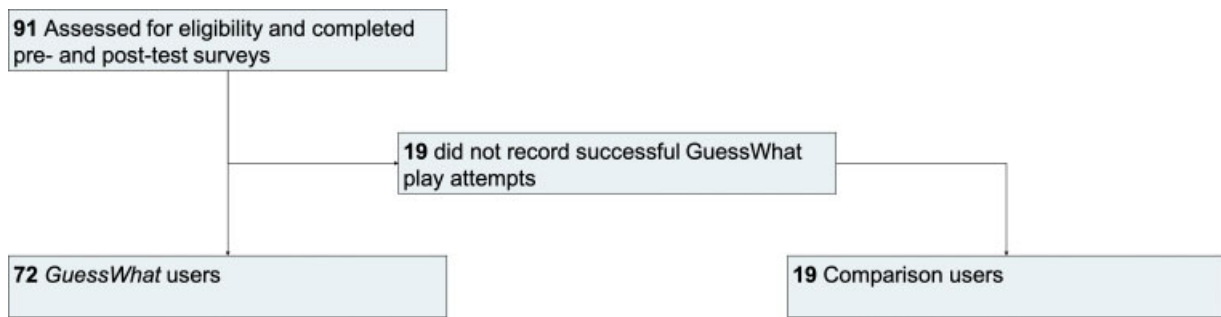
Fig. 2 Study groups. Ninety-one families were assessed for eligibility and completed pre- and post-test surveys between March 2019 and December 2020. Seventy-two families played GuessWhat as instructed. Nineteen families who did not record GuessWhat play attempts but fulfilled all other requirements were analyzed as a separate group for comparison.