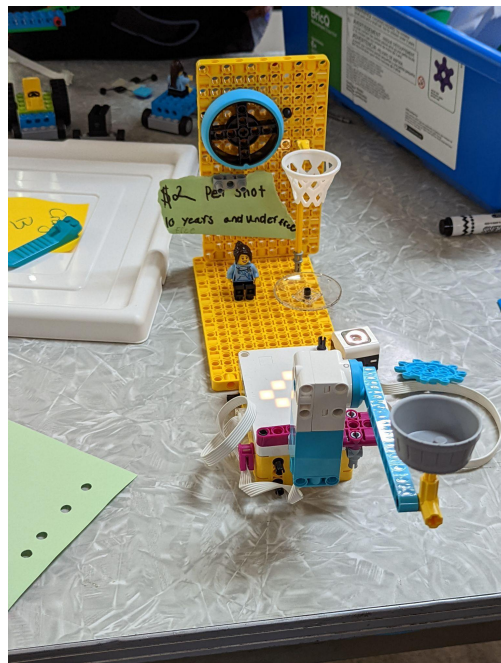
Figure 5: A carnival activity built by a student. Certain colors trigger basket-shooting attempts

Our design also allowed students to have agency in deciding what types of projects to work on and where to focus their efforts. Some students spent a lot of time working on the mechanical side of their projects and then simply added a motor and sensor at the end (as in figure 5) while others focused on the training while working with simpler machines. We noticed the building