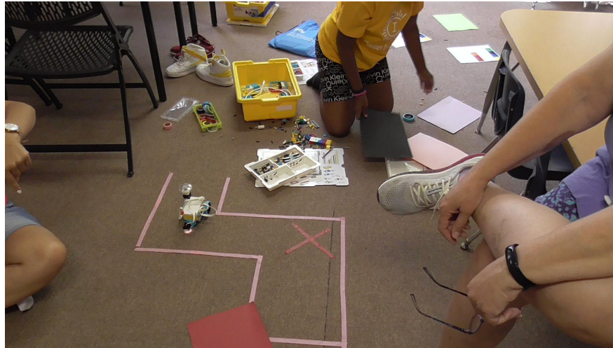
Figure 4: Students built an obstacle avoidance car

control (e.g., block-based coding). Although students almost universally grasped the training process eventually, we had to explain it to them repeatedly during the activities. We believe that the limited information displayed on Spike TM Prime is partially to blame. (Figure 4)