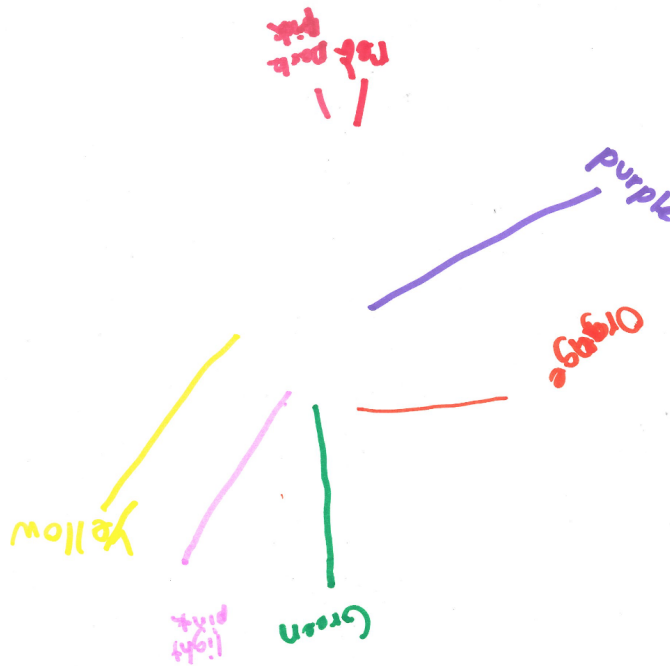
Figure 3: A sheet of paper used as part of the solution to the colorblind helper activity.

The third activity asked students to design a robot that throws away the trash of a certain color while ignoring the trash of other colors. The goal of this activity was to help students learn the training process. However, most students interpreted this as asking them to build a sort of catapult. In this activity, we demonstrated how to train the system first, and handed out a