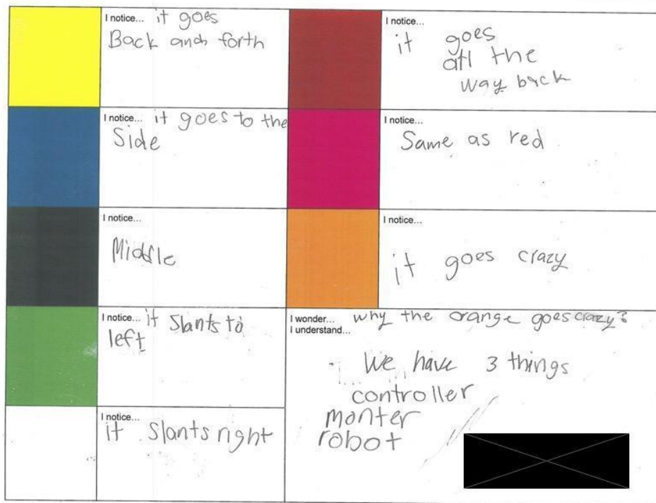
Figure 1: A filled-out worksheet from the activity to discover the setup of the pre-trained ML

of the forty students wrote down diagrams and angle estimates (i.e. 60°) to describe the motor's behavior.