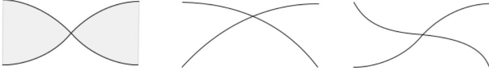
FIGURE 1. Min-max constant curvature curves can have a C^{1,1} point like the curve on the left. (Note that it is c -convex to the shaded region). Intersections as in the second and the third diagram cannot occur.

sequence of curves whose \mathcal{F}_c functional is converging to the critical value but whose areas and lengths are diverging.