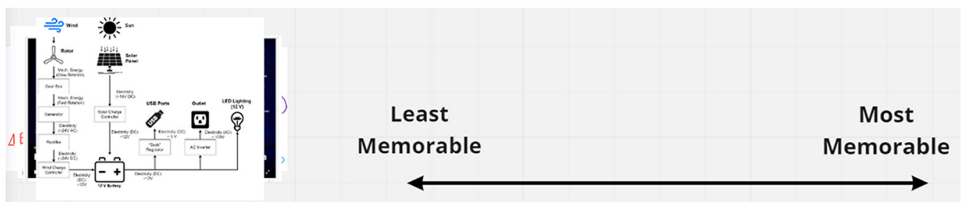
Fig. 1. Miro board at the start of the sort

The activity begins with seven cards stacked on top of each other on the left side of the screen in no particular order. Student participants were asked to drag and drop the cards from least to most memorable, at any point along the spectrum, in any way that made sense to them. Participants were explicitly told that they did not have to rank-order them and that it was fine to stack several cards in the same spot. The interviewer encouraged the participants to think aloud during the sort and explain their thought process at the end of the sort. Figure 1 shows the Miro board at the start of the card-sorting activity.