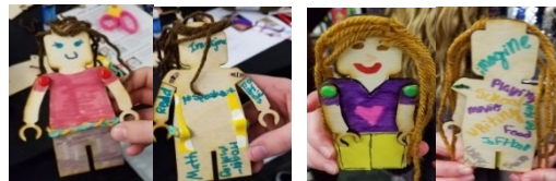
Figure 3. Examples of LEGO Me Puppet.