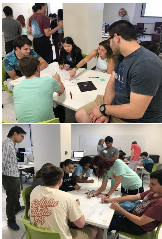
Figures 1 & 2: Examples of students participating in the Raising Question stations from 2018.

Once teams were formed, they were given a worksheet in order to write down and formalize their Team Research / Investigation Question. The final part of Day 1 featured an introduction to the SED tool by the facilitators. This also involved a small amount of time for students to investigate, and