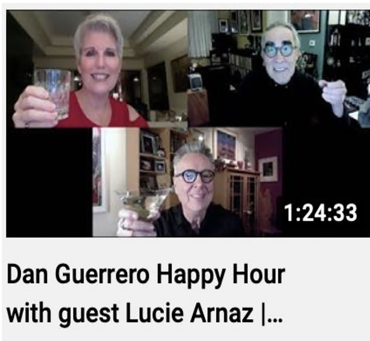
Figure 4: Happy Hour w/ Lucie Arnaz