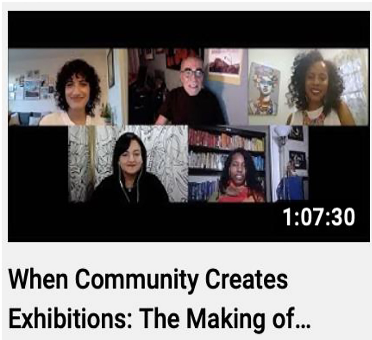
Figure 5: When Community Creates Exhibitions