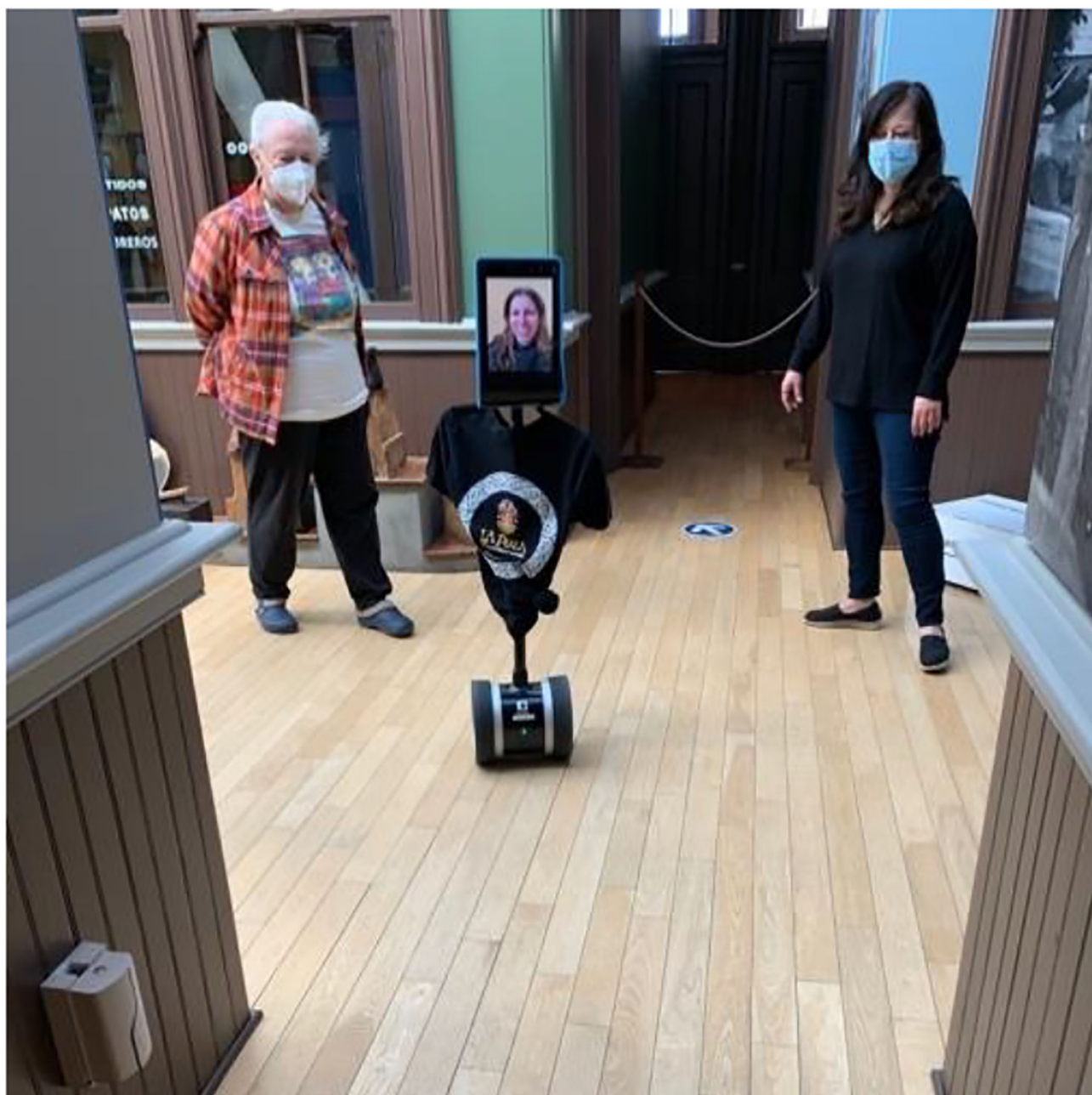
Figure 6: Double 3 in the Museum