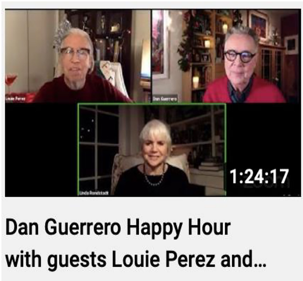
Figure 3: Happy Hour with Louie Perez and Linda Ronstadt