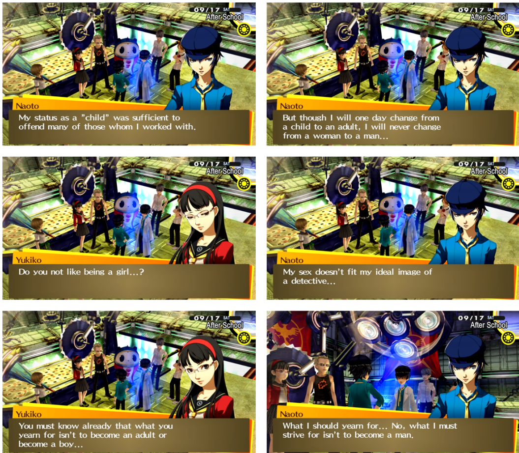
Fig. 7. A series of screenshots taken after defeating Shadow Naoto in combat. (read left-to-right, top-to-bottom). Top Left, Top Right: Naoto addresses that being a “child” is a state that can and will change with time but that changing from a woman to a man is impossible. Middle Left, Middle Right: Naoto states that being a woman doesn’t fit with their ideal lifestyle when asked if they don’t like being a girl. Bottom Left, Bottom Right: The character Yukiko, Naoto’s senior in age, tells Naoto what they want isn’t to be an adult or a man. Naoto agrees, stating they must not yearn nor strive to be a man. Screenshots taken by the authors.

Within the game, heterosexual gender performances are allowed to be shaped through interactions with the various characters by engaging in core mechanics of dialog choices with NPCs, establishing cis-heteronormativity. At the same time, the presence of queerness is never anything but threatening, as Shadow Naoto must be destroyed to continue the game. The ideology of bodily transition is depicted in this narrative as being so hazardous and incorrect that it becomes the antagonist of a whole game level, in this way contributing to systemic transphobia. Ostensibly, the narrative of Persona 4 Golden is meant to create a role-playing experience where players become and assist characters in overcoming their fear and anxiety. However, Naoto’s dysphoria and treatment in the narrative are more likely to create triggers of gender dysphoria in a trans audience, heightening their own fear and anxiety.