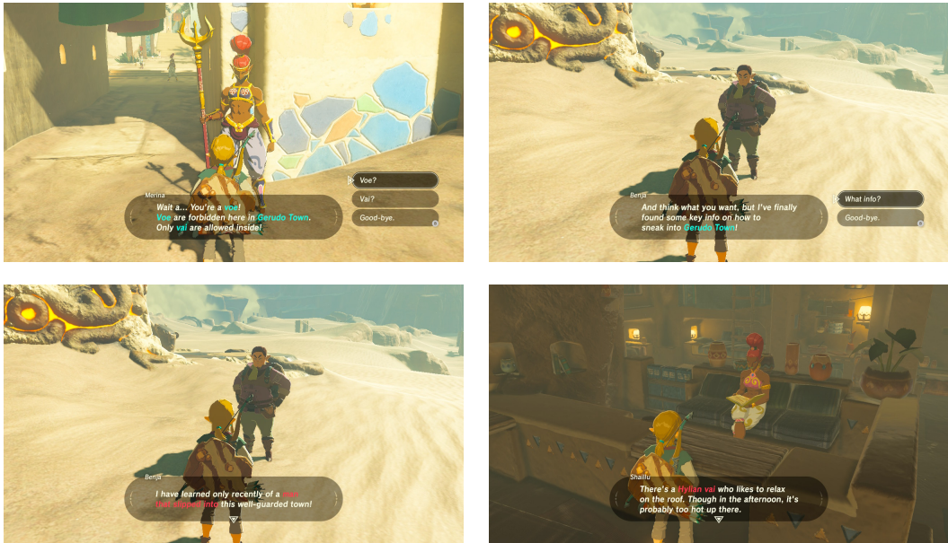
Fig. 2. A series of screenshots depicting key points in the quest to gain access to Gerudo town (read left-to-right, top-to-bottom). Upper Left: First, Link is denied access to Gerudo Town by a guard because they are a “voe” [man] and not a “vai” [woman]. Upper Right, Lower Left: Link locates and talks to a merchant who claims to have determined how to enter the town – a man previously snuck in. Lower Right: A townspeople who knows how to locate the relevant woman.

Since Link reads as a man, players must find a means to disguise themselves to persuade the guards that they belong there. Their search will eventually take them to the NPC Vilia, who is described as a male merchant who was somehow able to infiltrate the town. However, players find that Vilia identifies as a woman and wears feminine Gerudo attire (Figure 3). She denies having any knowledge of a man entering Gerudo Town, but she will assist players in dressing as a female Gerudo in order to progress. At the conclusion of the relevant cutscene, a gust of wind blows away the veil over Vilia’s face, revealing that she has facial hair, to Link’s shock.