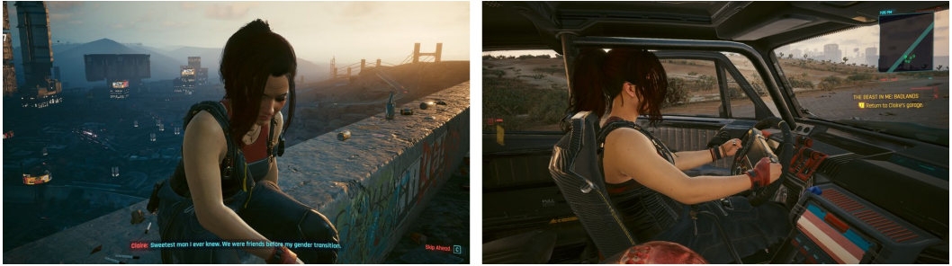
Fig. 5. In-game screenshots of Claire Russell during her quest line: The Beast in Me. Left: Claire speaking with the PC and describing her gender transition. Right: The interior of Claire's vehicle, The Beast, showing the transgender pride flag painted across her center stack.

epistemic awareness of trans people. It plays on colonialism and neoliberalism to produce a stigmatizing perspective that perceives transgender people via cisgender-supremacist spectacles [141]. Taking into account the marginalized social position of trans people, particularly trans feminine people in this instance, their bodies might be exploited as commodities by the market via stereotypes and stigma [141], exacerbating the social marginalization of transgender individuals [25]. Indeed, the trans figure shown on the poster as a hyper-sexualized representation of the objectified trans stereotype exacerbates the self-appearance-related discomfort and dysphoria of the trans audience [78]. Fredrickson and Roberts [50] argue that once appearance is socially valued and represented, individuals monitor their appearance to determine consistencies and inconsistencies, which would cause greater body shame. The Chromanticure poster design in Cyberpunk 2077 serves as a form of MECHANISM::objectification and commodification targeting trans people, which can lead to depression, anxiety disorders, bulimia [25], and form a trigger for gender dysphoria in trans players.