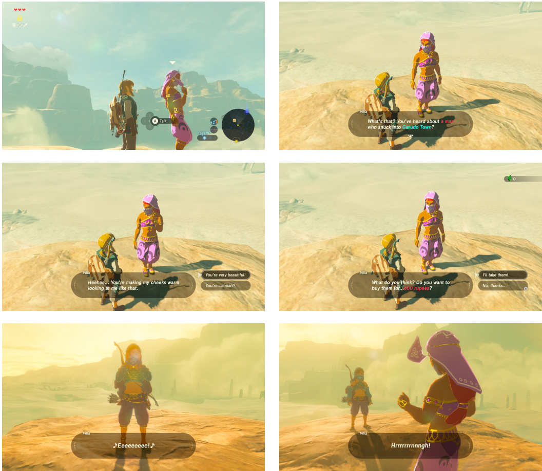
Fig. 3. A series of screenshots depicting part of Link's interactions with NPC Vilia (read left-to-right, top-to-bottom). Upper Left: Link finds Vilia; with the right camera angle, Vilia's face is visible. Upper Right: Link asks Vilia about a man entering Gerudo Town, to which Vilia expresses ignorance. Middle Left: After Link looks at Vilia, the player can either complement her or accuse her of being a man. Middle Right: After complementing Vilia, the player can purchase the Gerudo Outfit from Vilia. Bottom Left: Link after equipping the Gerudo Outfit. Bottom Right: Vilia's veil is blown aside, revealing her face and shocking Link.

essential to the illegitimatization of transgender identity (CAUSE::visual and ::textual). By staging Vilia's cutscene as a dramatic trans reveal , Breath of the Wild aims to make the player laugh at a cisnormative joke that frames trans identity as criminal and deceptive. By analyzing this scene through its triggering potential, we reveal a problem which was undiscovered by prior scholars' discussion of other games in the Legend of Zelda series through the lens of Bulter's performativity theory and queer theories around the gender portrayal of characters [79]. This prior analysis is insufficient to study the case of Vilia, who self-identifies as a woman while being designed to serve as a figure of mockery.