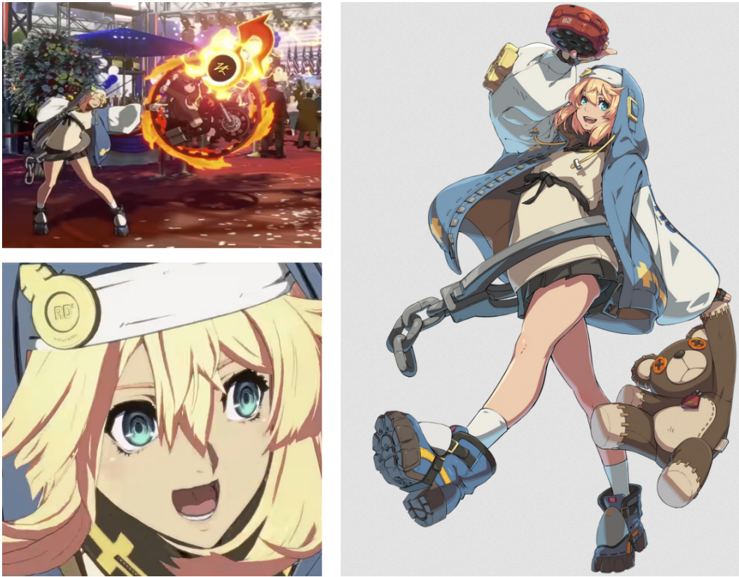
Fig. 8. A selection of screenshots and images from the official announcement trailer promoting Bridget's inclusion in Guilty Gear: Strive. Top Left: Bridget's in game character model. Bottom Left: Close up of the transgender symbol on Bridget's veil/ bandeau shown prominently during the trailer. Right: Full body artwork of Bridget used in promotional materials. Trailer and promotional materials as distributed by Arc System Works.

MECHANISM:: objectification in the game. The nearly flawless degree to which Bridget passes here is affirmed by many fans and commenters [45, 104, 110, 124, 142], as to how the concept of a 'trap' works.