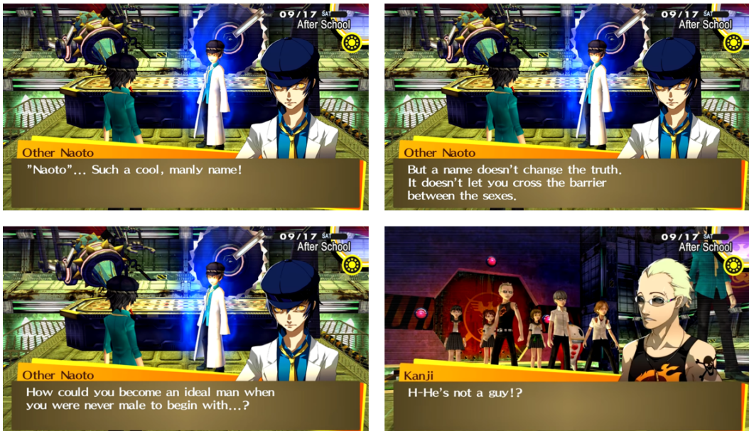
Fig. 6. A series of screenshots taken during the cutscene preceding a combat encounter with Shadow Naoto. Noteworthy are the crude surgical tools and devices behind the characters throughout the scene (read left-to-right, top-to-bottom). Top Left, Top Right: Shadow Naoto facetiously describes Naoto's name as "cool" and "manly" but denies that it can change Naoto's physical sex. Bottom Left, Bottom Right: Shadow Naoto outs Naoto to their team which is reacted to with shock and disbelief.