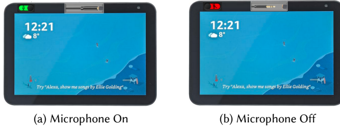
Fig. 1. Prototype with physical control and physical feedback

Physical Control & LED Feedback. This prototype (Fig 2) provides a physical hardware based on-off button to control (turn on and off) the microphone. However, for feedback, this prototype uses an LED to communicate the current status of the microphone. For example, when the LED is flashing green, it means the microphone is 'on' and when the LED is flashing red, it indicates the microphone is 'off'.