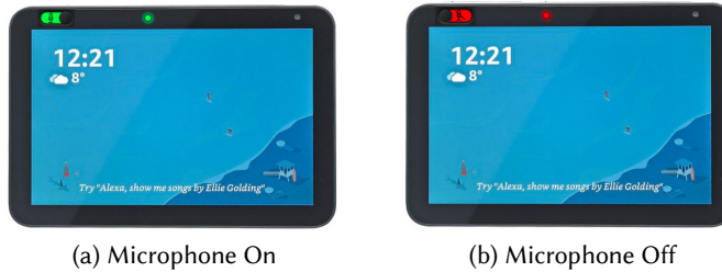
Fig. 2. Prototype with physical control and LED feedback

Physical Control & LED Feedback. This prototype (Fig 2) provides a physical hardware based on-off button to control (turn on and off) the microphone. However, for feedback, this prototype uses an LED to communicate the current status of the microphone. For example, when the LED is flashing green, it means the microphone is 'on' and when the LED is flashing red, it indicates the microphone is 'off'.