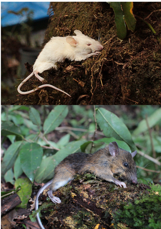
Figure 2: (Upper) Albino Maxomys hylomyoides LSUMZ 40343. Note the red eyes and complete lack of melanin in the feet, ears, and tail. (Below) Maxomys hylomyoides LSUMZ 40302 with wild-type coloration. Both specimens are from Mt. Singgalang.

mammals in Indonesia, including a well-publicized albino Bornean Orangutan ( Pongo pygmaeus ; Katz 2020), an albino Hairy-nosed Otter ( Lutra sumatrana ) from Bukit Barisan Selatan National Park, Sumatra (O'Brien and Kinnaird 1996), and an albino Sunda Slow Loris ( Nycticebus coucang ) also from Bukit Barisan Selatan National Park (International Animal Rescue 2018). Albinism may be less surprising in these larger, less abundant mammals, as all have undergone population declines due to habitat loss (IUCN 2020). We did not capture any other individuals with color abnormalities among 85 M. hylomyoides . Several folkloric stories from the people living near Gunung Singgalang place an emphasis on encountering all white birds or all white rats while hiking on the mountain. These stories, along with more abundant records from other regions, suggest that albinism in Southeast Asian murids is more common than indicated by the sparse scientific record.