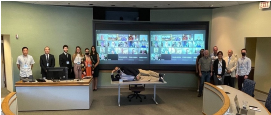
Fig. 1. In-person attendees at the 17th WAMC workshop pose with online attendees.

The upcoming field season, 2022–23, for the UW-Madison AWS network (Fig. 2) will consist of two separate projects and deployments. The deployment of group 1 will be in the early season based out of McMurdo to focus on Cape Hallett and Alexander Tall Tower while completing standard service work. Group 2 will prioritize West Antarctica to recover Austin and Kathie while completing the West Antarctic Tall Tower installation. Both groups will continue tests on the polar climate and weather stations (PCWS), a joint project between UW-Madison and Madison Area Technical College while raising