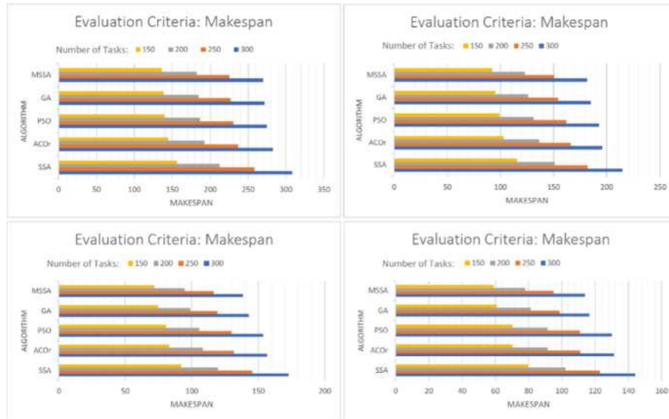
Fig. 6. Performance output for the four scenarios, comparing MSSA with other algorithms; MSSA shows lower calculation amount, which is desirable as lower values indicate improved efficiency in minimizing makespan for cloud computing task scheduling.

As shown in Table 6, the MSSA algorithm achieved an average completion time that was 5.40%, 5.66%, 6.68%, and 6.40% better than the average completion time of SSA, ACOr, PSO, and GA, respectively. Furthermore, the standard deviation of the MSSA algorithm was lower than that of other algorithms, indicating more consistent performance. The findings of this study provide valuable insights into the efficiency of different optimization algorithms for scheduling cloud computing tasks. The MSSA algorithm has shown substantial potential in reducing task completion time and improving the overall performance of cloud computing systems. Therefore, it can be concluded