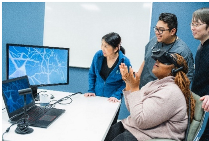
Figure 2. Set-up of the virtual reality equipment.

The participants have a VR headset adapted for their mobile phones to visualize the experience from their homes. The mobile phone-adapted headset for the participants was bought from a web-based vendor, and the brands used included BNext and Viotek, depending on market availability.