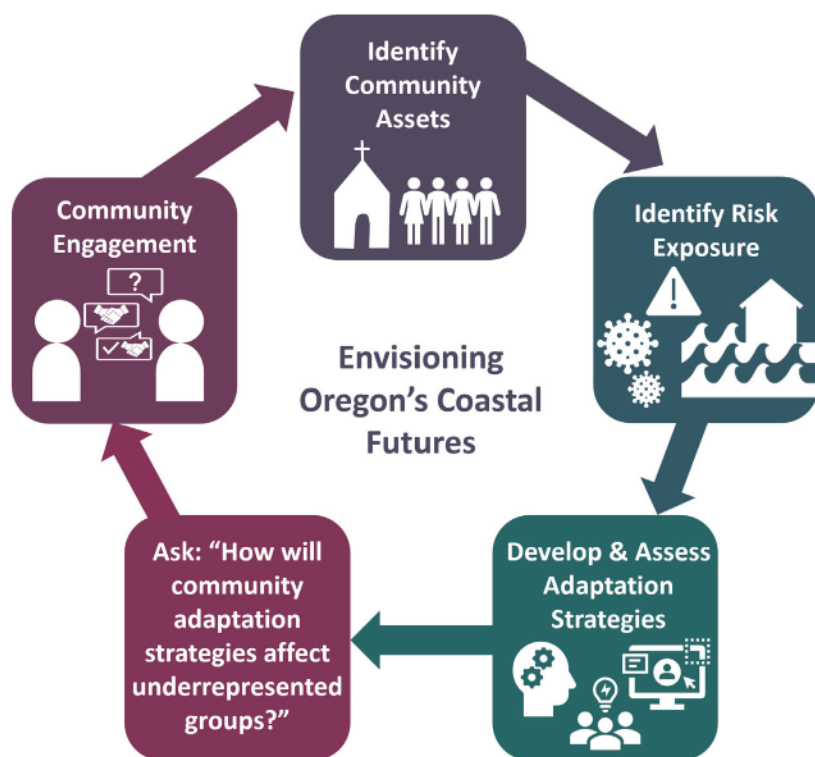
FIGURE 2. Project process of deep community engagement, community asset identification, risk quantification (for both chronic and acute hazards), and assessment of mitigation and risk reduction measures via modeling equitable dynamic adaptation pathways.

In addition to applying transdisciplinary approaches of Western science, the project approached scientific questions about drivers of and responses to water quality changes from a framework that emphasized place-based knowledge and multiple ways of knowing. This goes far beyond applying Indigenous knowledge in the study design (i.e., utilizing knowledge of tribal fisherpeople to establish sampling sites, sample timing, and hypotheses). A core partnership between academic institutions and a sovereign tribe was central to our approach. In part because of the highly transdisciplinary and cross-cultural nature of the project, the team navigated challenges uncommon in typical research and engagement as we aimed to put a decolonizing approach into practice (Smith,