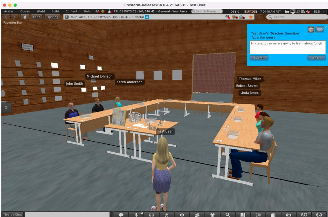
FIGURE 1 The interface of AI-supported virtual simulation.

classroom recordings, mainly from TIMSS ( https://nces.ed.gov/timss/ ) and Ambitious Science Teaching ( https://ambitiousscienceteaching.org/ ), which were used for training and localization of the language model that drives Evelyn . Evelyn underwent iterative training and testing to generate real-time, contextualized responses to various inputs. The interaction with virtual students in this study was text-based, where participants would address the whole class or individuals by clicking on different correspondence gadgets. More details on the Evelyn student model can be found in Appendix A.