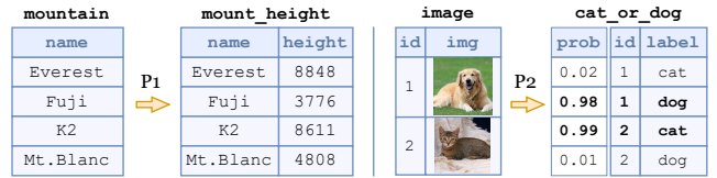
(c) Example input-output relations of the programs.