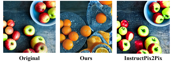
Instruction: Replace the bowl with something else, and change the apples to other fruits.

Compositional multi-modal reasoning. For VQA, we pick ViLT-VQA (Kim, Son, and Kim 2021) (a pre-trained foundation model) and PNP-VQA (Tiong et al. 2022) (a zero-shot VQA method) as baselines. As shown in Table 5, our method significantly outperforms the baseline model on both datasets. Compared to the neural-only baseline, our approach that combines DSL and logical reasoning more effectively handles intricate logical operations such as counting and numerical comparisons. On GQA, our method out-