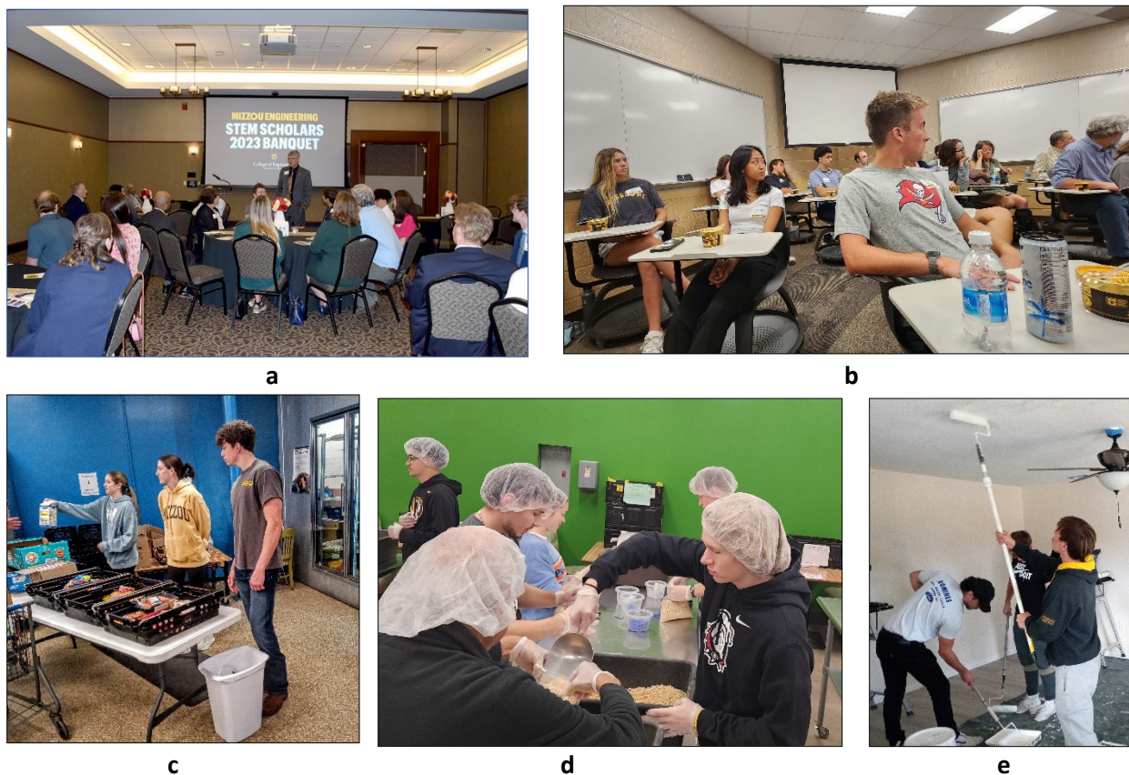
Fig. 2: STEM Scholars Program -Professional networking and personal growth activities during 2023. (a) 2023 STEM Scholar Recognition Banquet for Cohorts 1 and 2 – April 2023, (b) 2023 Meet and Greet welcoming ceremony for Cohort 3 – August 2023, (c) Scholars volunteering at the Food Bank Pantry – March 2023, (d) Packing individual food packets from bulk food donations at the Food Bank – October 2023, and (e) Painting ceilings at a new Habitat for Humanity subdivision home – November 2023.

for this training and look forward to continuing such training during Summer 2024. Some Scholars from Cohort 2 (Fall 2022) have participated in internships and as undergraduate research assistants in faculty-led research projects ahead of schedule, even as they are nearing completion of G8 coursework. It is heartening to note that we have been successful in accomplishing one of the project goals, which is retention of Scholars supported on NSF STEM Scholarships in STEM fields.