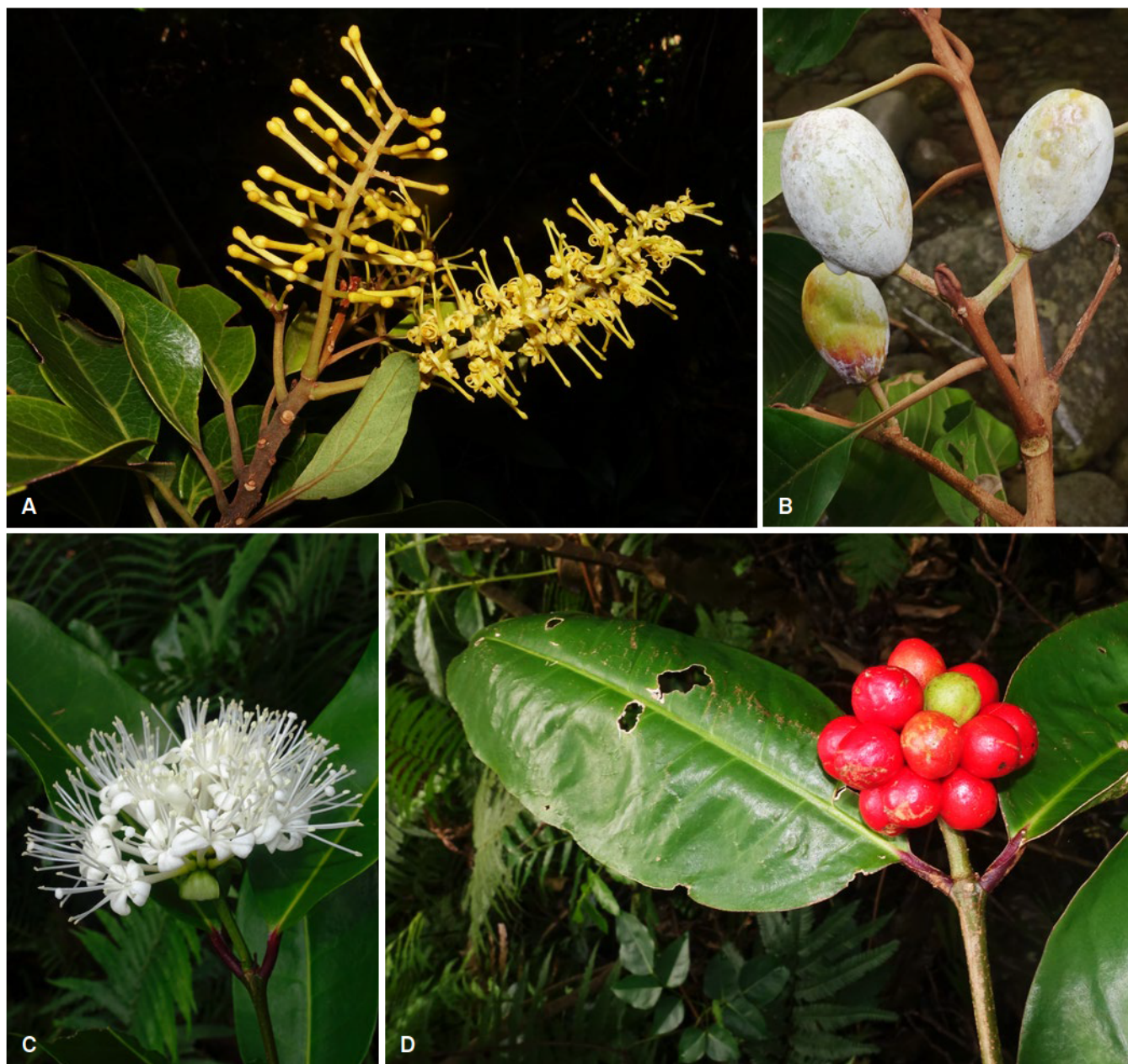
Fig. 5. – A. Turrillia lutea (Guillaumin) A.C. Sm. (Proteaceae); B. Palaquium neobudicum Guillaumin (Sapotaceae); C, D. Phaleria pentecostalis Leandri (Thymelaeaceae). [A: Plunkett 4194; B: Plunkett 4546; C, D: Plunkett 5433]