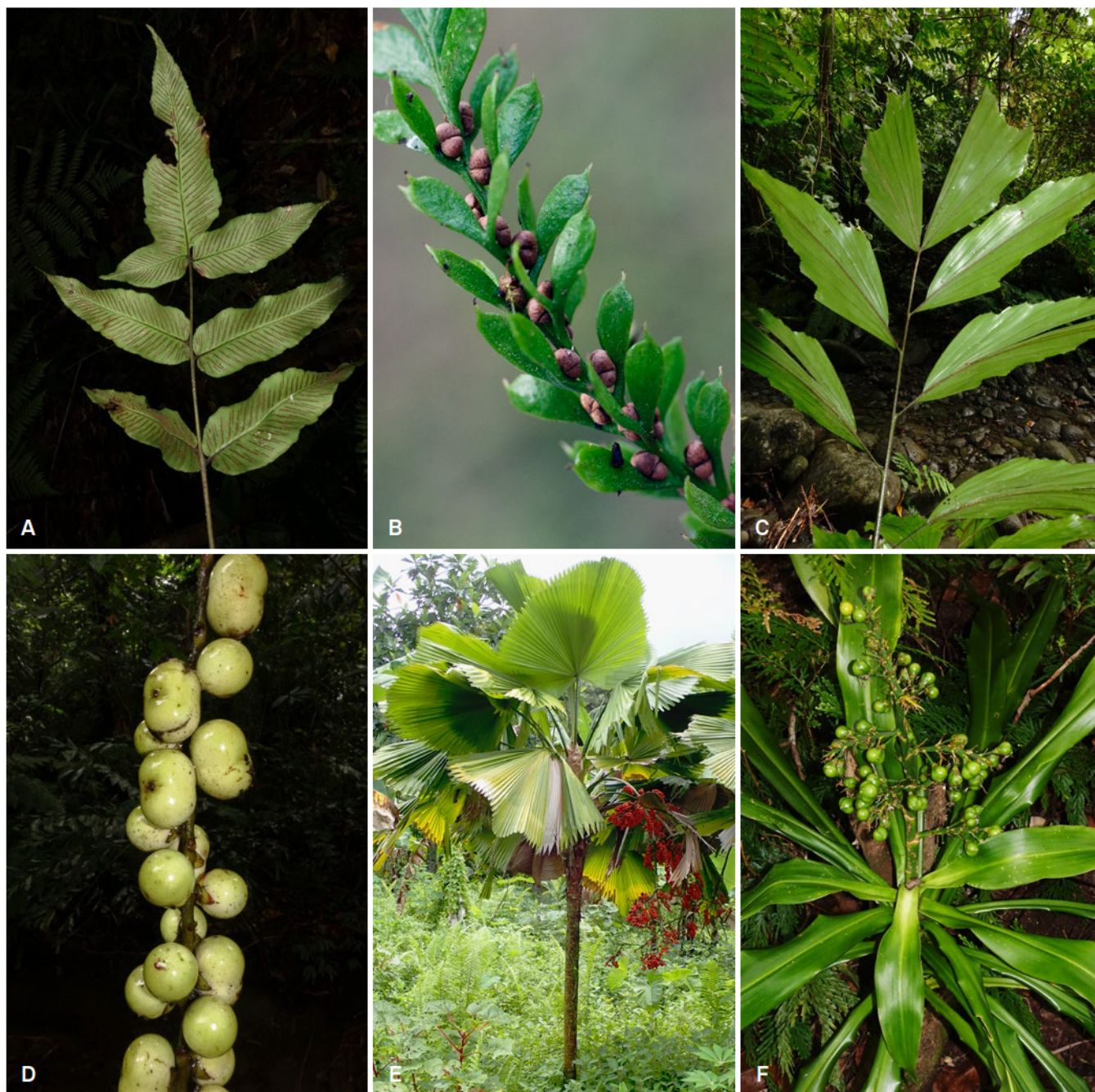
Fig. 2. – A. Diplazium oblongifolium (Hook.) Jermy (Athyraceae); B. Tmesipteris vanuatensis A.F. Braithw. (Psilotaceae); C, D. Caryota ophiopellis Dowe (Arecaeae); E. Licuala grandis (T. Moore) H. Wendl. (Arecaeae); F. Dracaena sp. nov. (Asparagaceae). [A: Plunkett 5255; B: Plunkett 2861; C, D: Plunkett 4558; E: Plunkett 5653; F: Plunkett 4869]