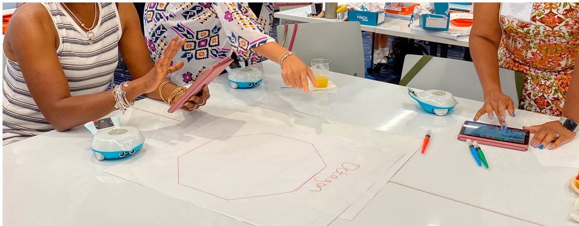
Figure 2. Teachers learning robot coding to draw plane shapes

new school playground, and they had to figure out the possible widths and lengths of a rectangle of a given area. The Basketball Court activity asked students to divide the schoolyard of a given area in order to donate some space for a community basketball court. The Slides activity asked students to consider possible designs of slides for big kids and toddlers, given the areas that these slides could occupy in the park. In the Jungle Gym activity, students designed a playground that is wheelchair accessible. In all these activities, they coded Finch to draw their designs on square grid mats to check the area. The coding elements included movement and right-turn blocks, as well as the repeat blocks that enabled students to represent measurements using the concept of place value of two-digit numbers.