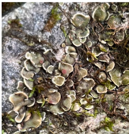
Figure 7. Psora pseudorussellii growing on rock at the quarry during the Teakettle Prairie field trip.

After exploring the prairie and forest edge, members then followed the flagging into the woods where they found a large patch of Dicranum sp. (wind-swept moss) with sporophytes (Fig. 6). They also spotted several minute brown and reddish Frullania sp. (scalewort) species growing on tree bark throughout the forested section of the hike. Eventually, the flagging led members out into the old quarry site. Bryologists noted that the quarry was home to the almost black and frequently dry Grimmia pilifera (dry rock moss), while lichenologists rejoiced after identifying two previously undocumented lichens for the area, Placidiopsis minor and Psora pseudorussellii (Fig. 7). These lichens were growing as an intertwined series of discs on the same exposed rock. Everyone spent time here enjoying the sun and working on their field identifications. After leaving the quarry, members hiked through more deciduous forest on a small ridge where there were several exposed rocks. Thuidium delicatulum and Leucobryum glaucum were found in large carpets as members made the trek back to the trailhead.