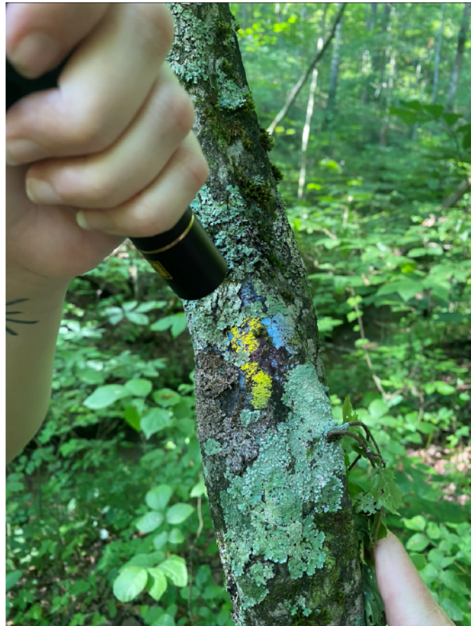
Figure 5. Pyxine soorediata (mustard lichen) glowing under UV light.

Lynx Prairie consists of many grassland openings scattered throughout the otherwise forested region. Bryologists and lichenologists started down an old road bed trail, excited to make their way through the forest and to an open prairie. Once at the prairie, the group split up to explore the many unique niches of the prairie and surrounding forest. Those who decided to bushwack into the woods found a small stream that eventually led out into the prairie. Within this streambed, bryologists found Bryoandersonia illebra (worm moss), Fissidens sp., and Pogonatum pensilvanicum . They followed the stream into the prairie where it eventually ended at limestone outcrops, creating a wet, seepy area. Here, they found Drepanocladus aduncus (variable hook moss) and Thuidium delicatulum (delicate fern moss) growing on organic soils. Pottiaceae species were also found growing on the limestone outcrops within crevasses.