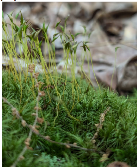
Figure 6. Dicranum sp. (wind-swept moss) with sporophytes found within the forest area of Teakettle Prairie.

trail was forested and went uphill before reaching a stream. Within this stream, bryologists found Fissidens sp. growing on wet rocks. After passing by the stream, the forest opened to expose Teakettle Prairie. This prairie was less than an acre in size and was broken into two parts by an encroaching forest with a floor dusted with tufts of Cladonia sp. Shortly after entering the prairie, the trail along the logging road ended and was replaced by red flagging, which marked a loop through the prairie, deciduous forest, and old quarry site.