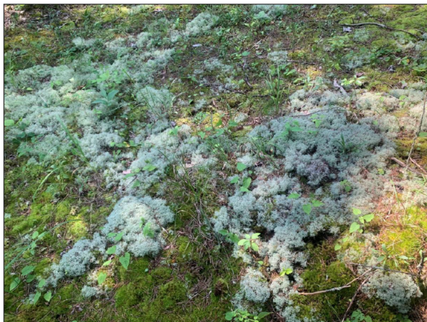
Figure 4. Cladonia spp. (reindeer moss) carpeting the ground at Abner Hollow Preserve.