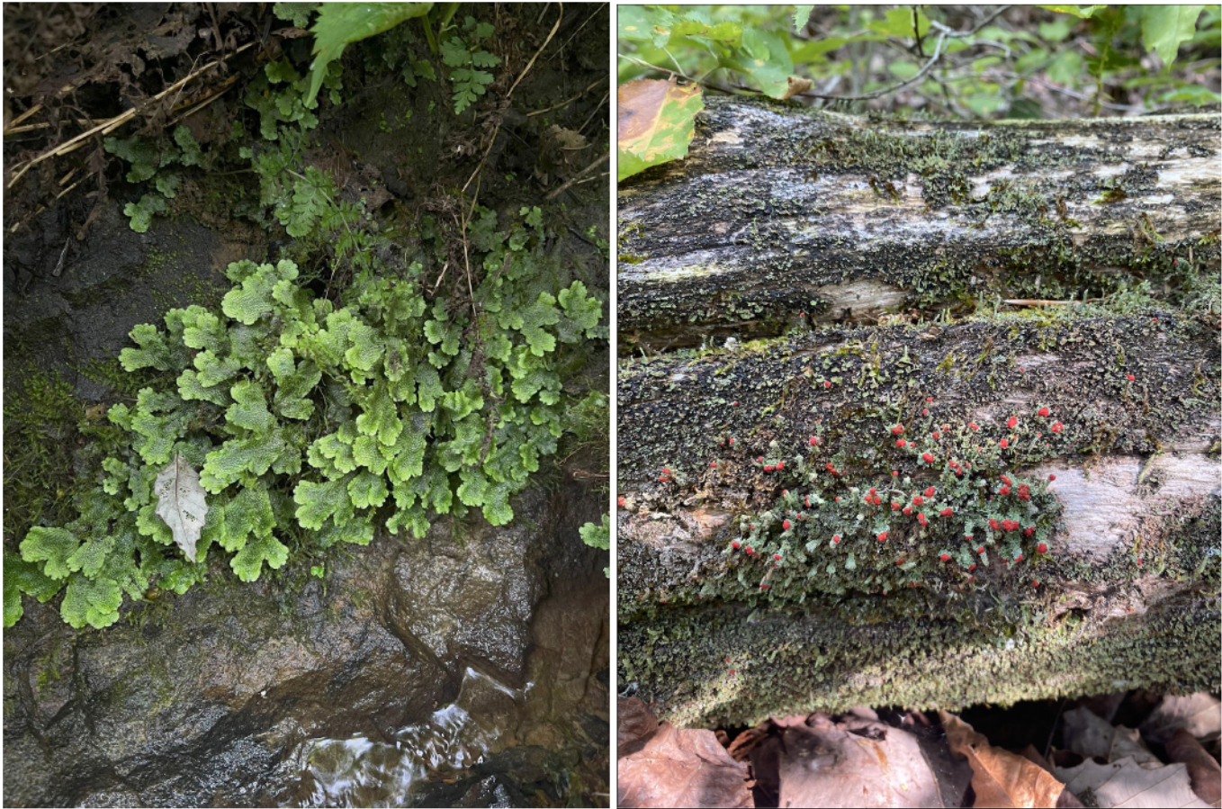
Figure 10 (left). Conocephalum sp. (snakeskin liverwort) found growing on a rock in a wet streambed during the Wilderness Preserve Trail field trip.